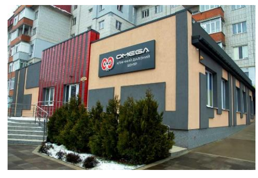
UKRAYNA OMEGA DIALYSIS CENTER 15 Bads