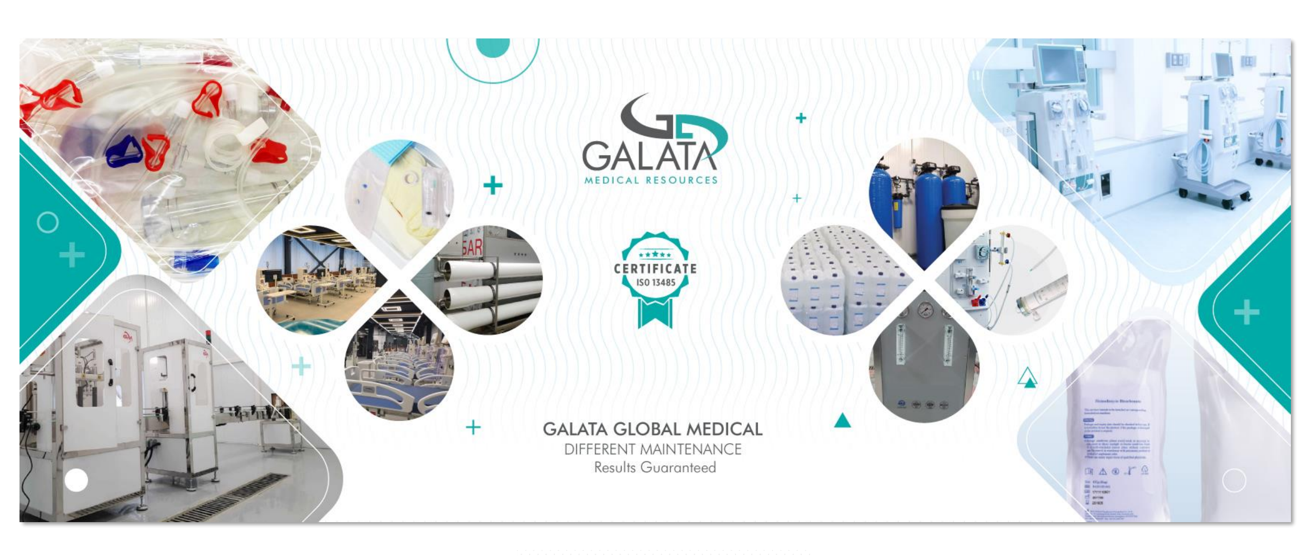
Hemodiyaliz Ürün Kataloğu