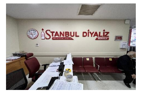
HD ISTANBUL DIALYSIS CENTER 35 Bads