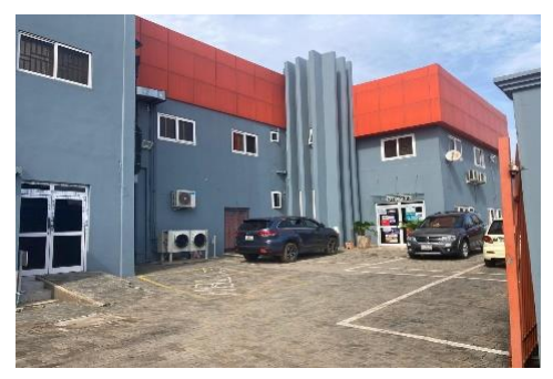
GANA PSH DIALYSIS CENTER 22 Bads